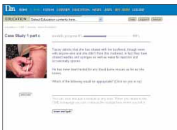
Example of electronic learning module

The RCGP and SMMGP are able to offer assistance and signpost commissioners to accredited trainers from their network of practitioners, comprising regional leads in substance misuse, mentors and facilitators.